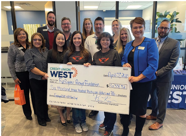
Firefighter Angel Foundation