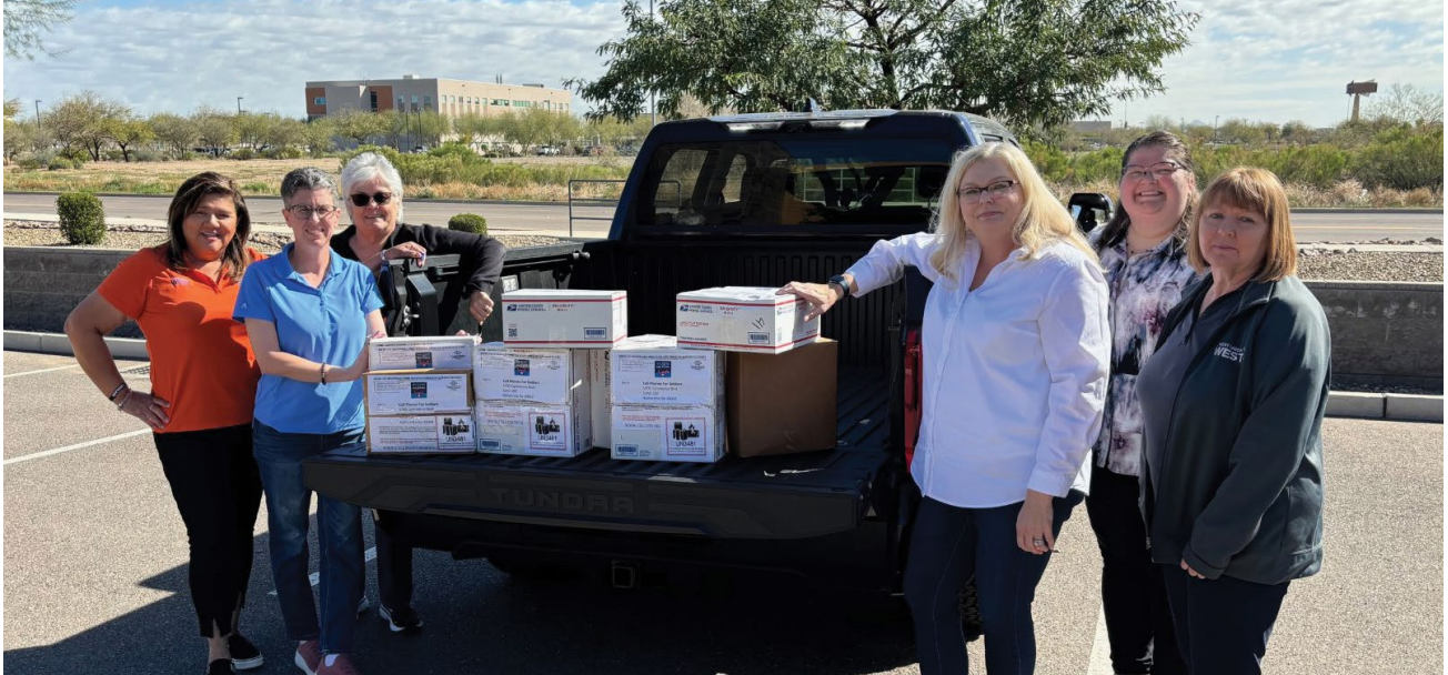
Cell Phones for Soldiers