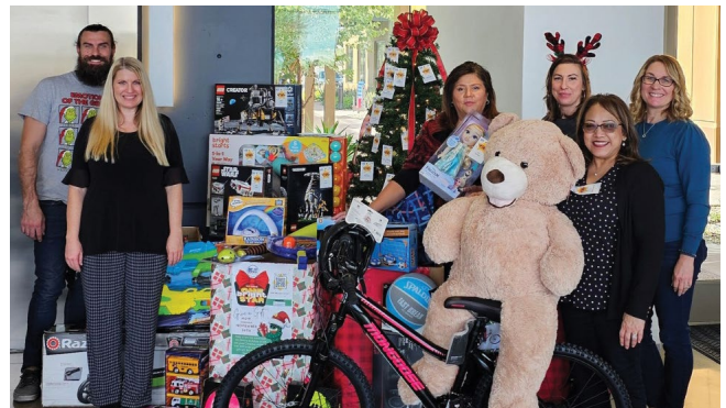
OCJ Kids Holiday Gift Drive