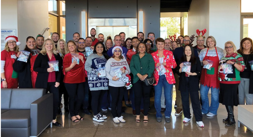
Jobs for Arizona's Graduates (JAG)