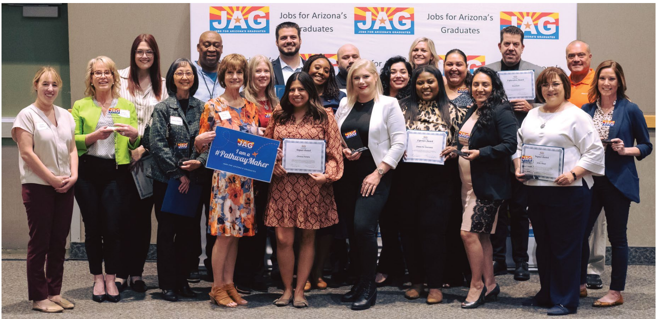
Jobs for Arizona's Graduates (JAG) Arizona Pathway Makers Awards