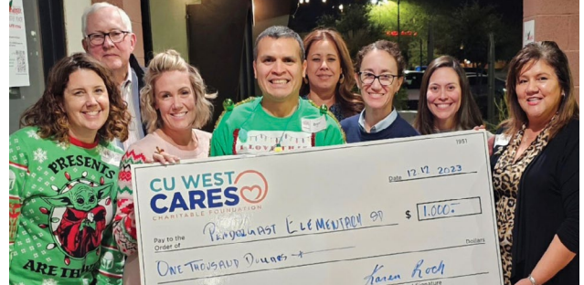
Pendegast Elementary School District