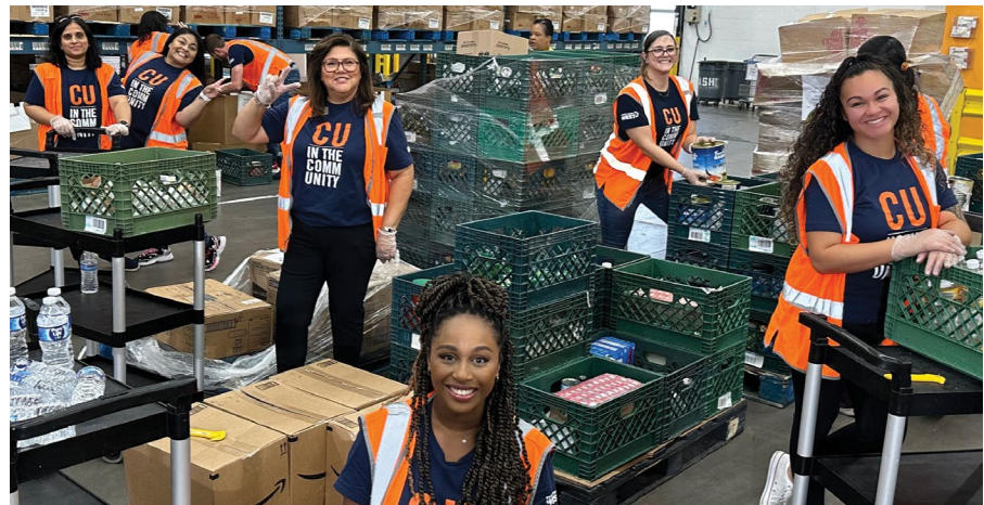
St. Mary's Food Bank