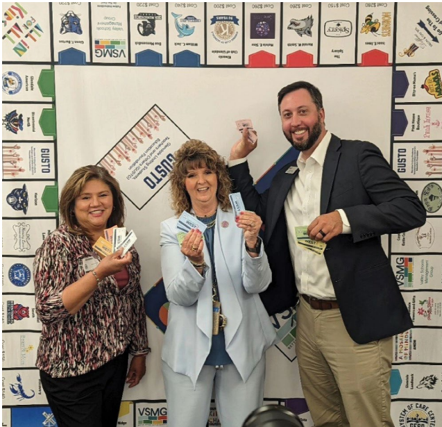
The Glendale Uniting Students Teachers and Others (GUSTO) Foundation GESE-OPOLY Fundraiser

The CU West CARES Charitable Foundation grew from these same fundamental principles. The foundation aims to support vital resources that strengthen our neighborhoods through charitable contributions and grants. This funding is given to organizations and individuals that enhance the quality of life for local community members. In 2023, the credit union and foundation supported a variety of initiatives, totaling 53 donations and sponsorships.