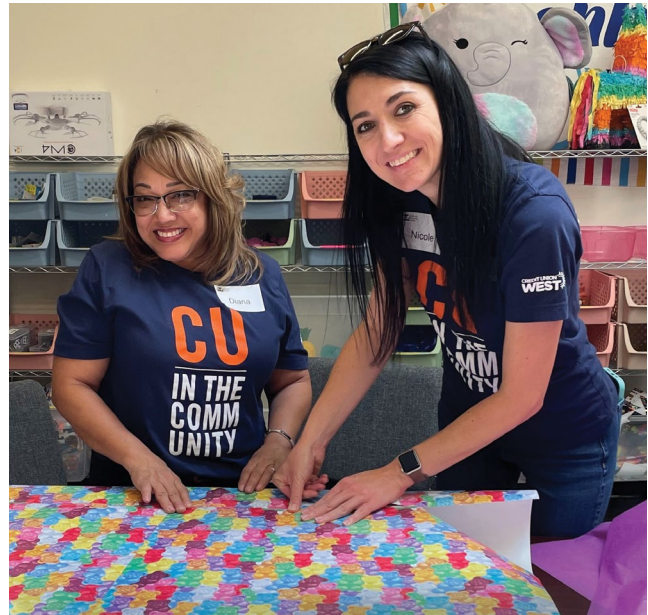
The Foster Alliance (AZ Helping Hands)