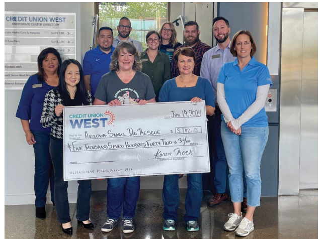
Arizona Small Dog Rescue