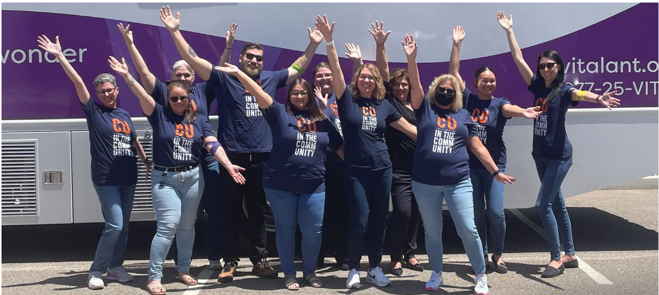
Credit Union West Blood Drive with Vitalant