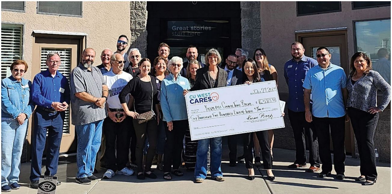
Yavapai County Food Bank