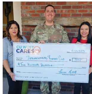
Dragonslayers Booster Club, Luke AFB