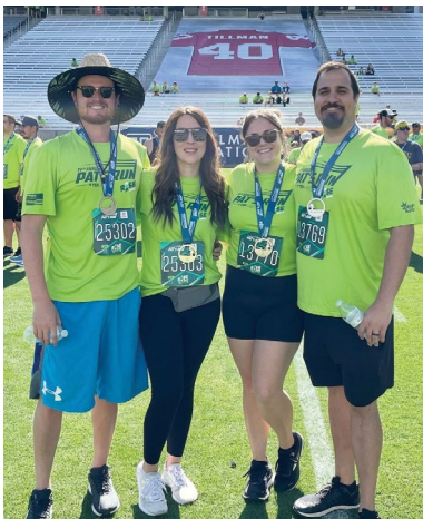
Pat's Run benefiting the Pat Tillman Foundation