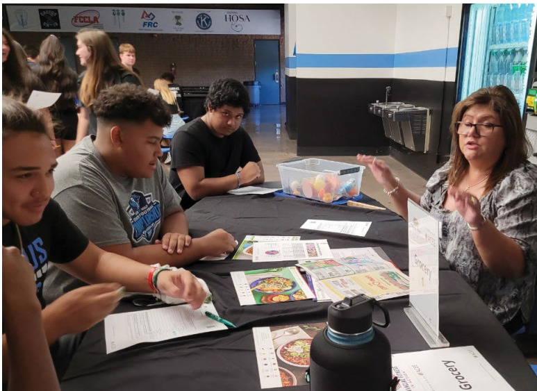
Arizona Council on Economic Education Financial Fitness Workshop at Cactus High School

In 2023, the credit union launched the CU@Work Program, a workplace benefit service that provides easy access to credit union membership at one's place of employment. The program features financial education training and resources to help equip employees with the tools they need to successfully manage their money and achieve their financial goals. Education topics cover banking basics, understanding your credit score and report, budgeting strategies, applying for your first mortgage, and retirement planning. Enrollment in the CU@Work program is free and increases the value of an employee's benefit package up to $3,776.