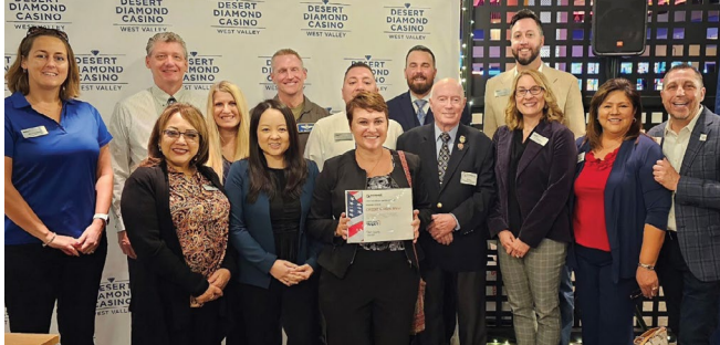
Glendale Chamber of Commerce Military Appreciation Event