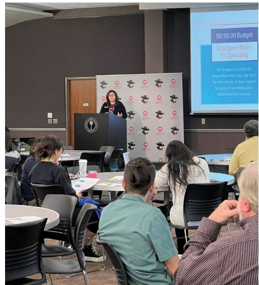
GCC Innovation Challenge Financial Success Workshop