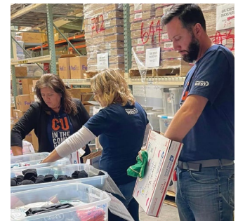
Packages from Home