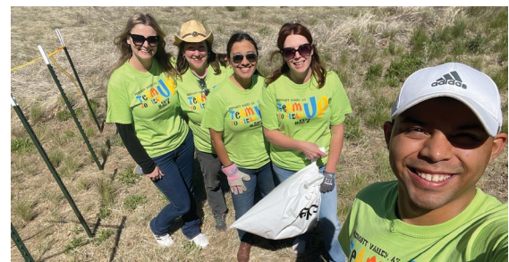
Prescott Valley Chamber of Commerce Team Up to Clean Up