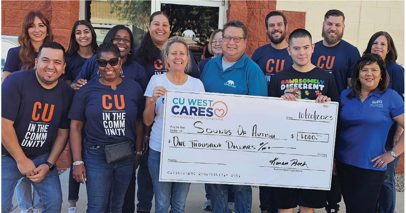
Sounds of Autism