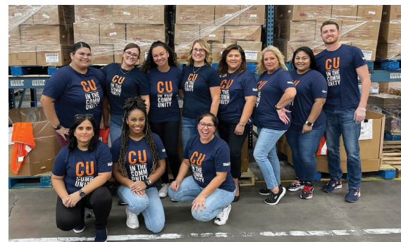
St. Mary's Food Bank