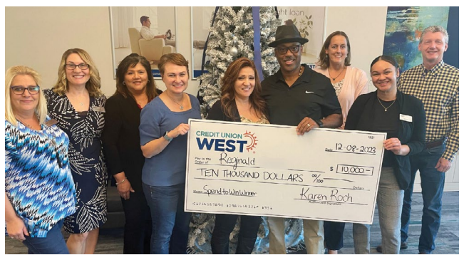
Holiday Spend to Win Winner