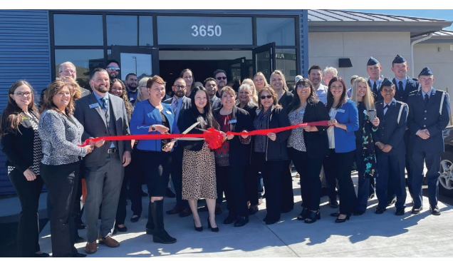
Prescott Valley Branch Grand Opening